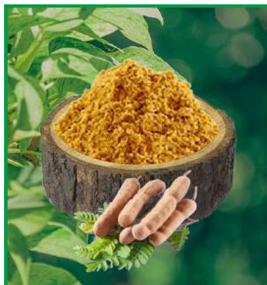
TAMARIND (IMLI) POWDER