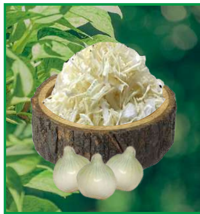
WHITE ONION FLAKES