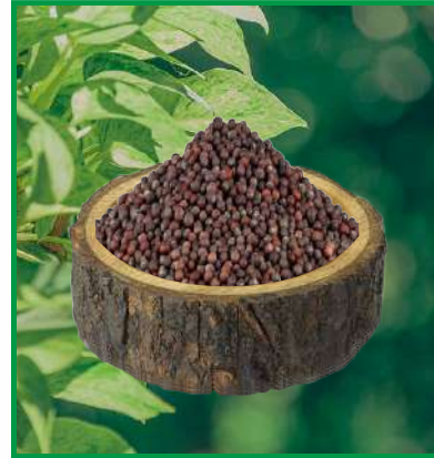
BLACK MUSTARD SEED