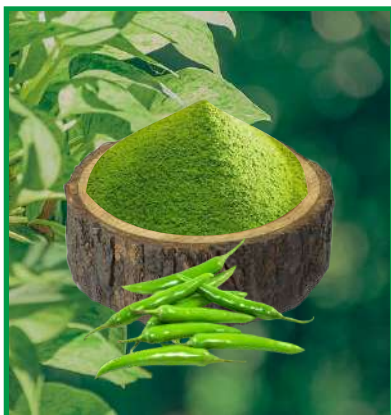
GREEN CHILLI POWDER