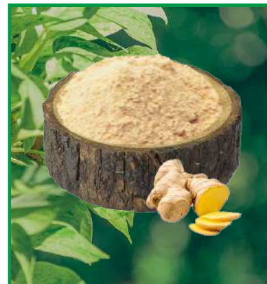
DEHYDRATED GINGER POWDER