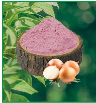
DEHYDRATED PINK ONION POWDER