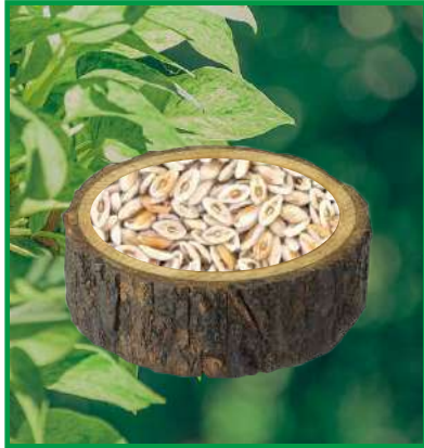
PSYLLIUM HUSK (ISABGOL)