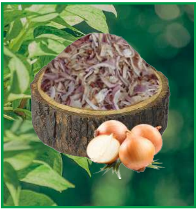
DEHYDRATED PINK ONION FLAKES