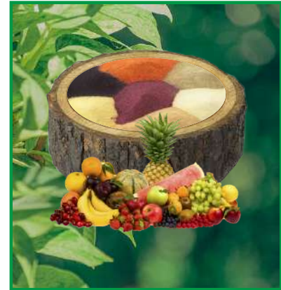
SPRAY DRY FRUIT POWDER