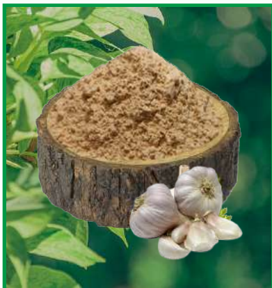
DEHYDRATED GARLIC POWDER