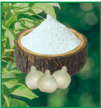
WHITE ONION POWDER