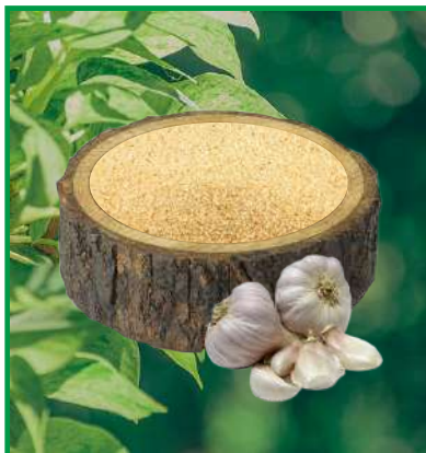
GARLIC GRANULES POWDER