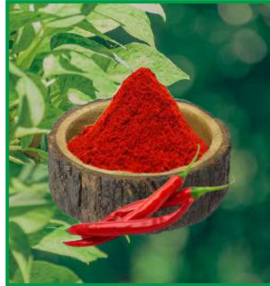
RED CHILLI POWDER