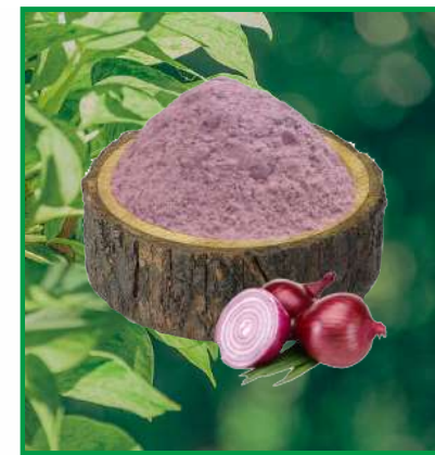
DEHYDRATED RED ONION POWDER