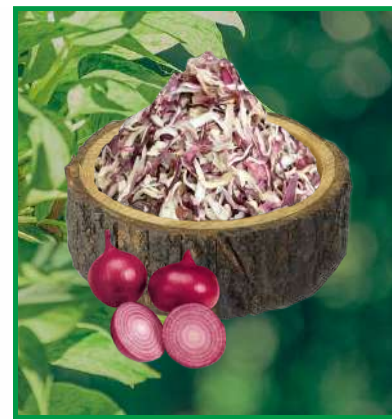
RED ONION FLAKES